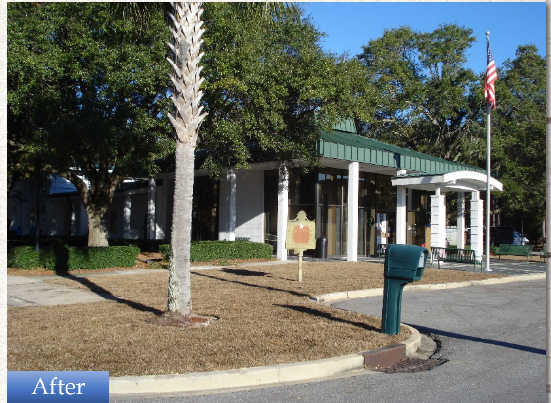
Little River Welcome Center (Highway 17 Southbound)