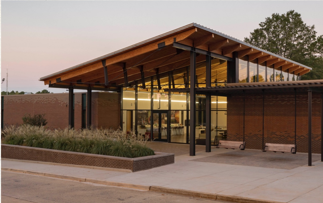
Fort Mill Welcome Center (I-77 Southbound) Construction Completed: March 2017 Total Construction Cost: $4,677,469.06*

*Includes $944,384.81 from SCDOT for new Traffic Control Center