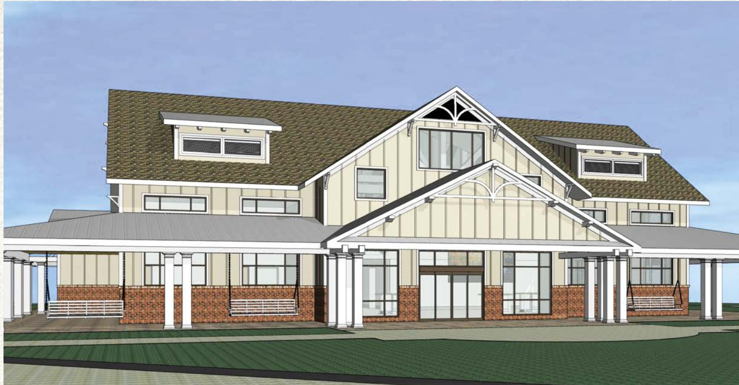
Dillon Welcome Center (I-95 Southbound)

Estimated Construction Completion: August 2019