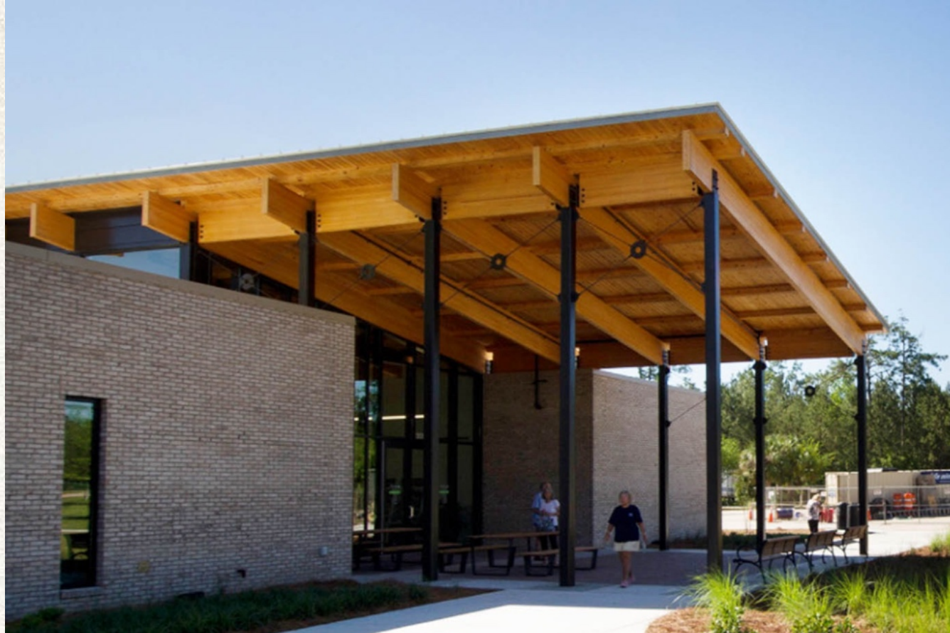
Hardeeville Welcome Center (I-95 Northbound)

Construction Completed: May 2017 Total Construction Cost: $4,089,913.17