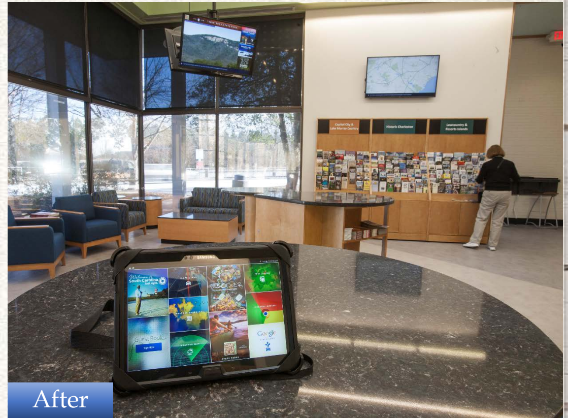
Landrum Welcome Center (I-26 Eastbound)